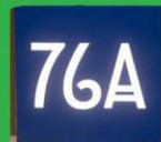
reflective house numbers

Carbon monoxide is a heavier gas. Alarms should sit lower to the ground to be most effective. RT Dutchess installs alarms with 10-year lithium batteries that last the life of the alarm on each floor.