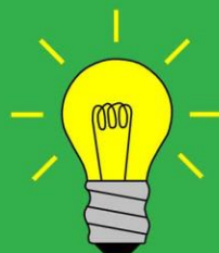
LED light bulbs

RT Dutchess installs motion-activated solar security lights on the exterior of the home to assure safe, illuminated entry and exit.