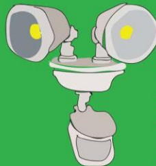
motion-activated solar light

RT Dutchess installs ABC fire extinguishers in an easy access location near an exit route. Remember P.A.S.S. - pull, aim, squeeze, sweep.