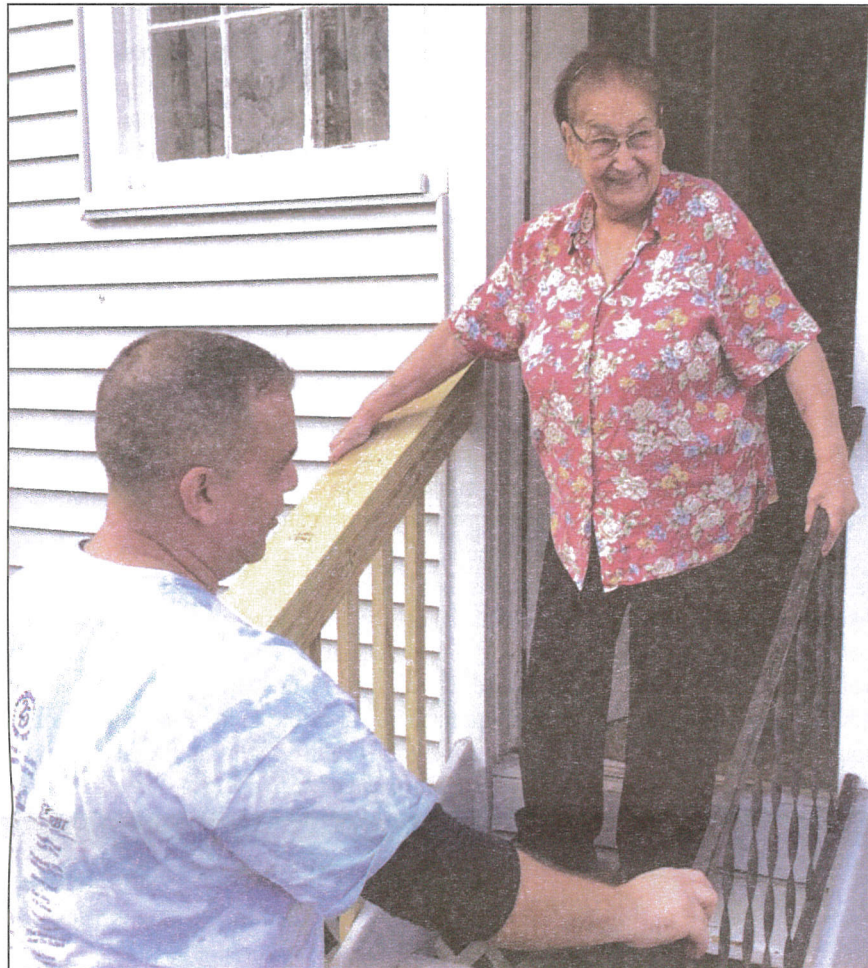
A homeowner admiring her new stair railing.