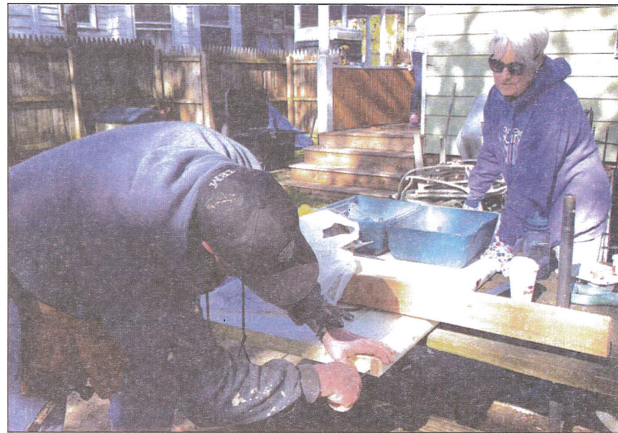
Volunteers hard at work on a door repair during a Rebuilding Day project.