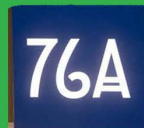
reflective house numbers

Carbon monoxide is a heavier gas. Alarms should sit lower to the ground to be most effective. RT Dutchess installs alarms with 10-year lithium batteries that last the life of the alarm on each floor.