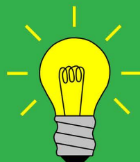
LED light bulbs

RT Dutchess installs motion-activated solar security lights on the exterior of the home to assure safe, illuminated entry and exit.