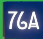
reflective house numbers

Carbon monoxide is a heavier gas. Alarms should sit lower to the ground to be most effective. RT Dutchess installs alarms with 10-year lithium batteries that last the life of the alarm on each floor.