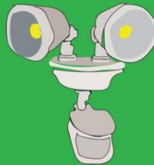
motion-activated solar light

RT Dutchess installs ABC fire extinguishers in an easy access location near an exit route. Remember P.A.S.S. - pull, aim, squeeze, sweep.