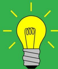
LED light bulbs

RT Dutchess installs motion-activated solar security lights on the exterior of the home to assure safe, illuminated entry and exit.